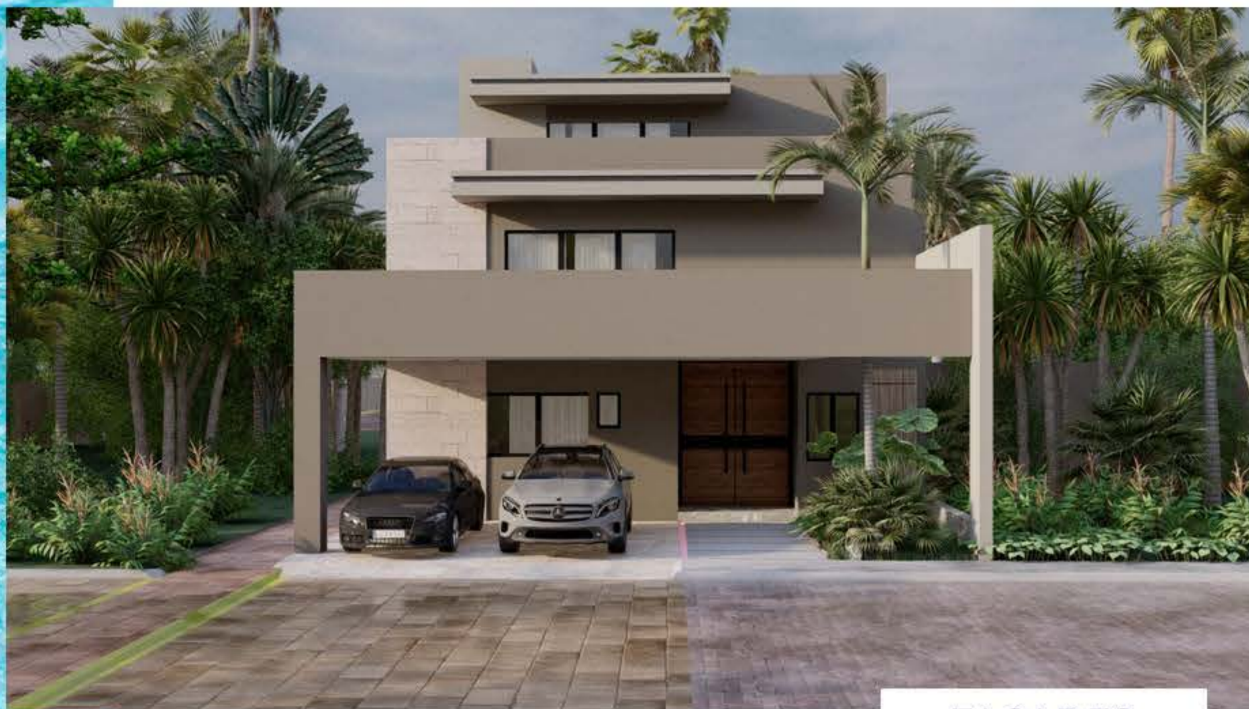
FACADES LOT 225 m 2