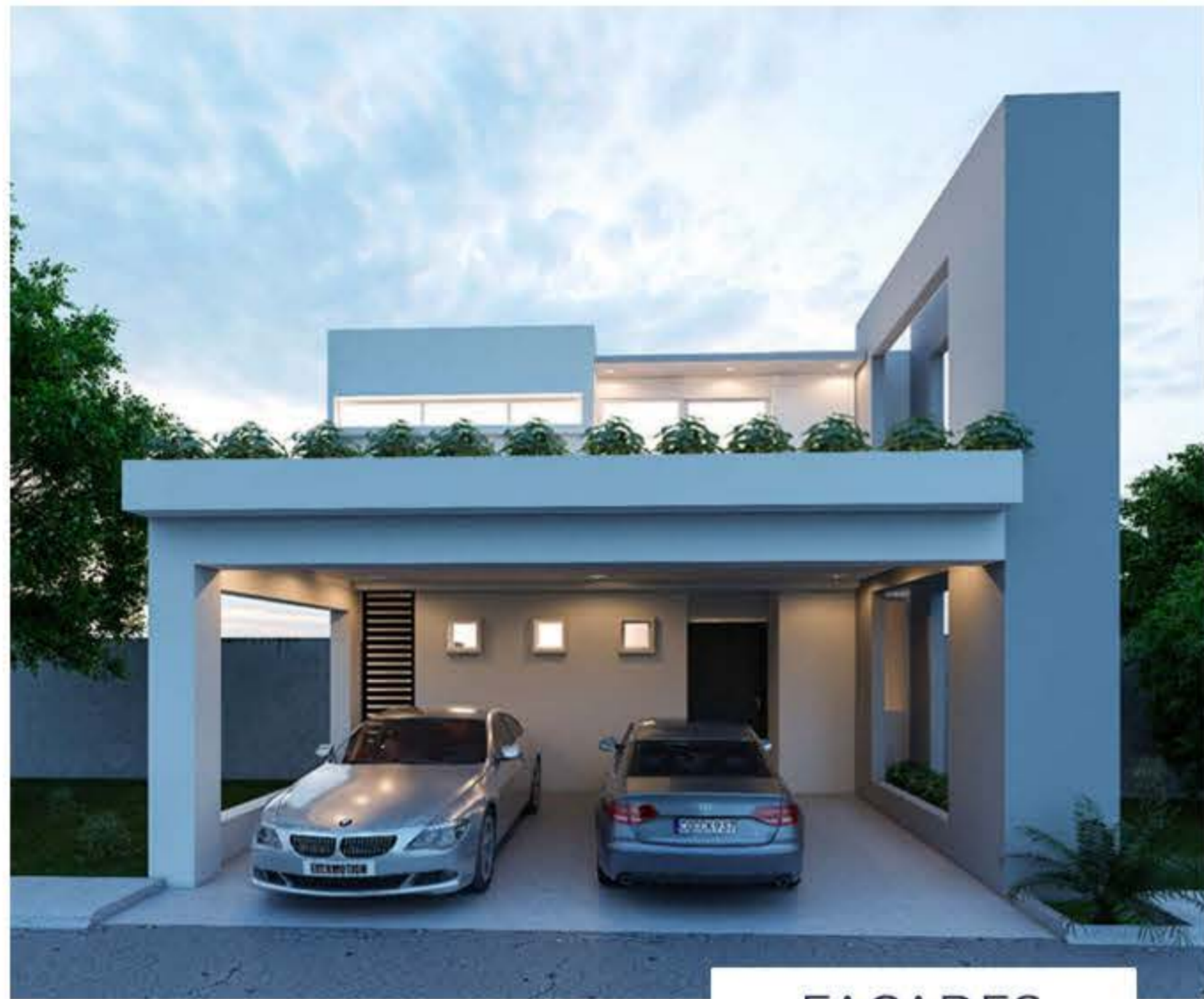
FACADES LOT 180 m 2