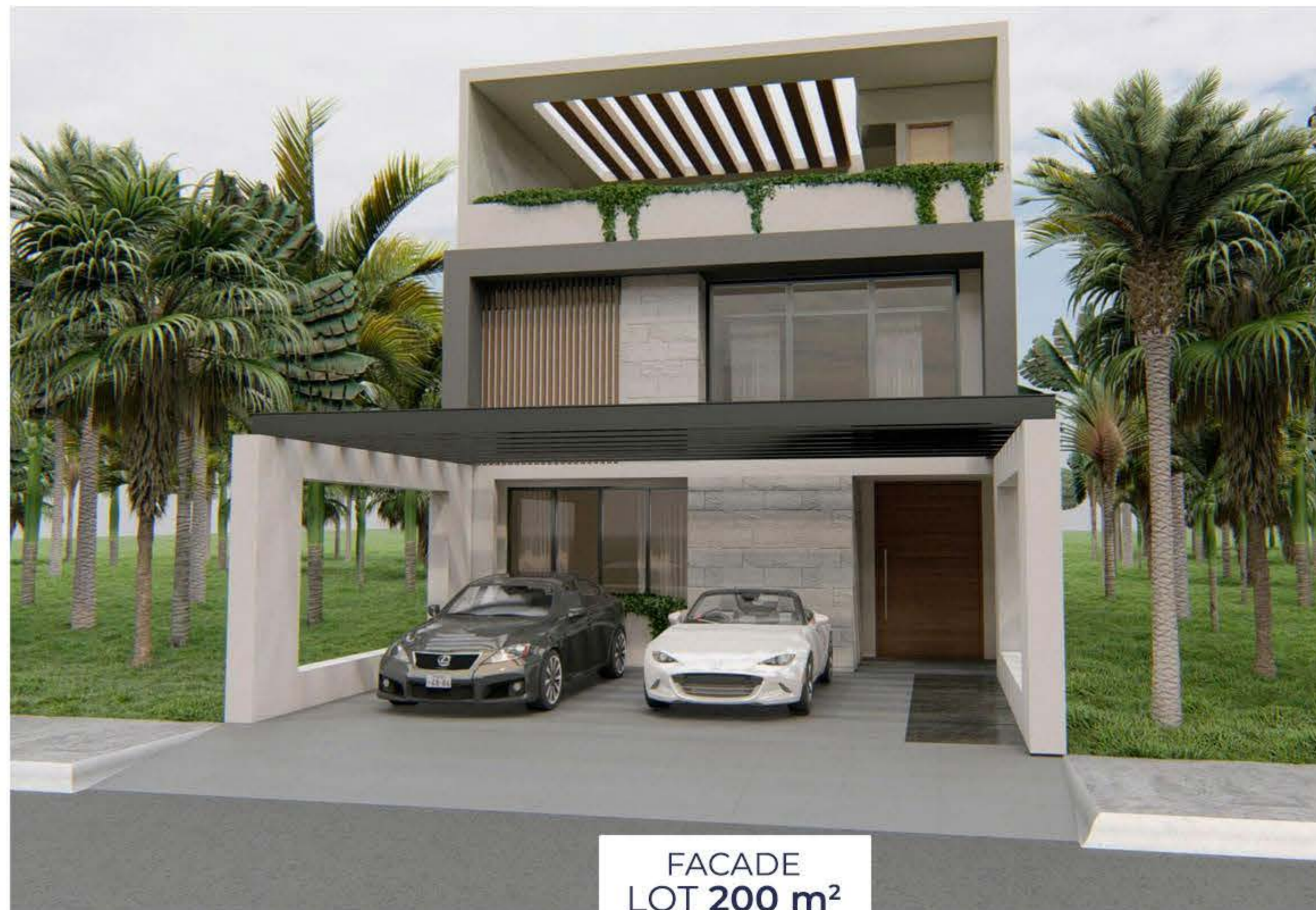
FACADE LOT 200 m 2