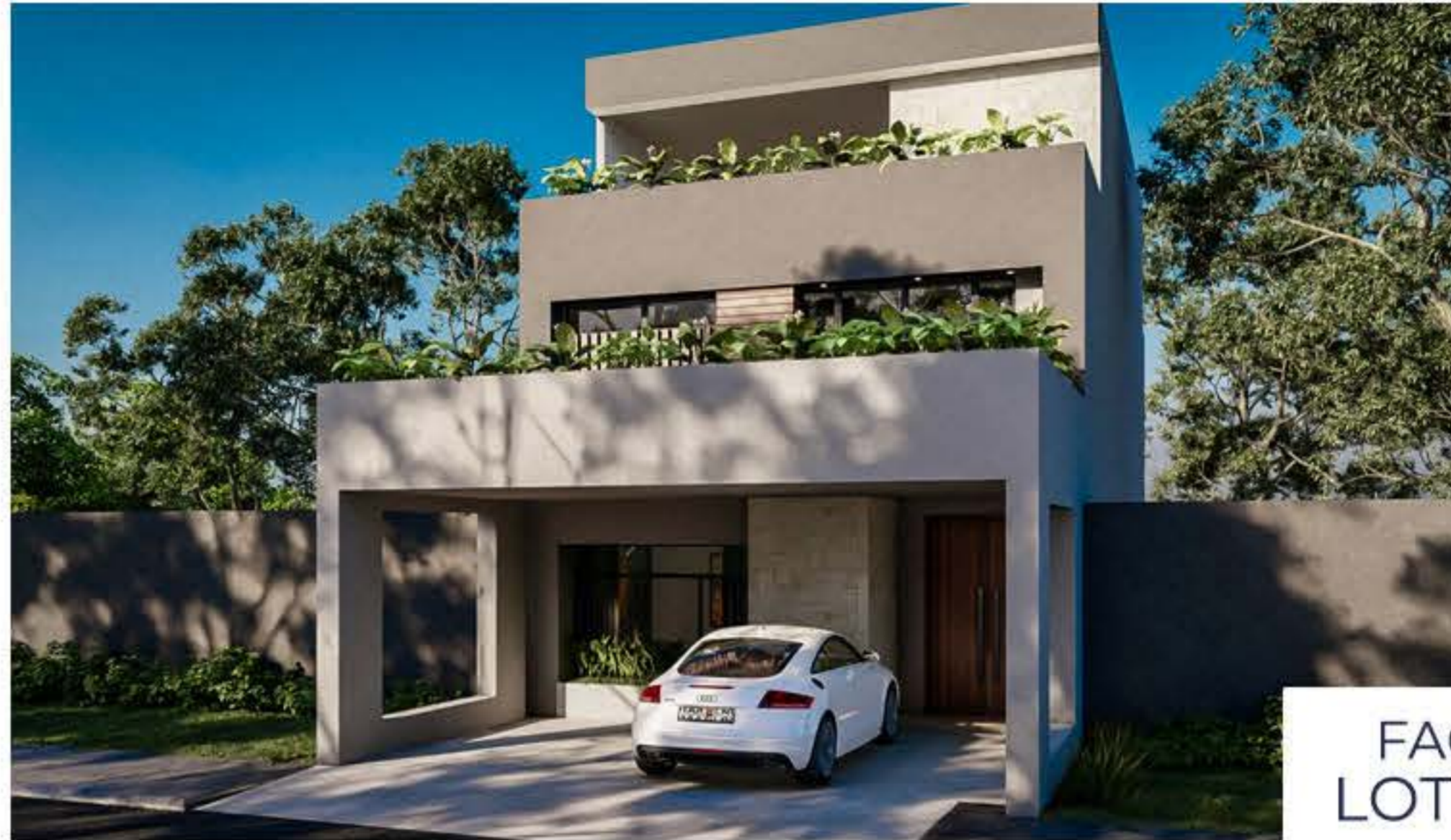
FACADES LOT 160 m 2