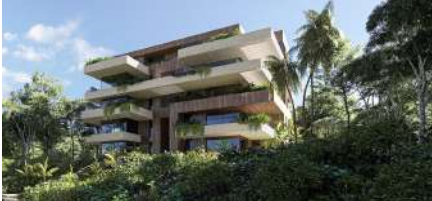
The Reserve at Mayakoba