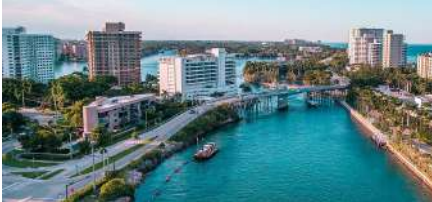
Boca Raton Florida