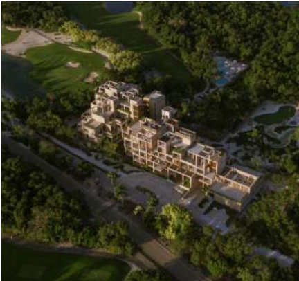
The Village at Corasol for RETA Members